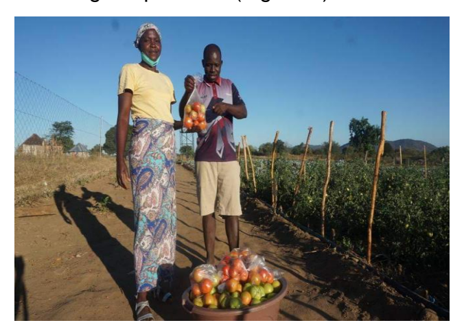
Figure 5: Roadside tomato sale

and distribution of the produce. However, local markets still remained a significant form of selling the products (Figure 5).