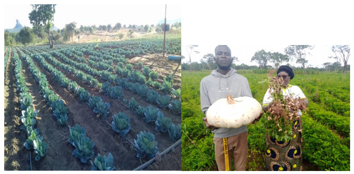
Figure 4. Production in Zambia and Zimbabwe

As part of the initiative to minimize dependence on trees for firewood, the partner facilitated the installation of 5,000 efficient cookstoves not only for the direct project beneficiaries but also to the surrounding villages.