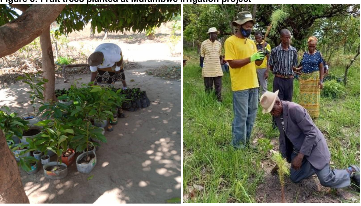
Figure 5: Fruit trees planted at Mufumbwe irrigation project

The irrigation project has facilitated the cultivation of high value and nutritious horticultural crops such as green vegetables, onions, egg plant, tomatoes and okra